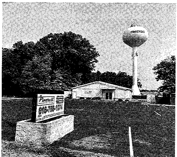
Pincrest Self Storage, formerly The Storgae Group