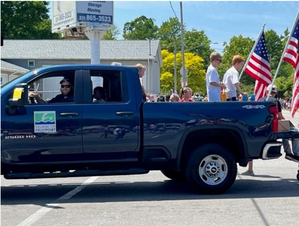
Fruitport Community Postcard for Fall Clean Up Days: