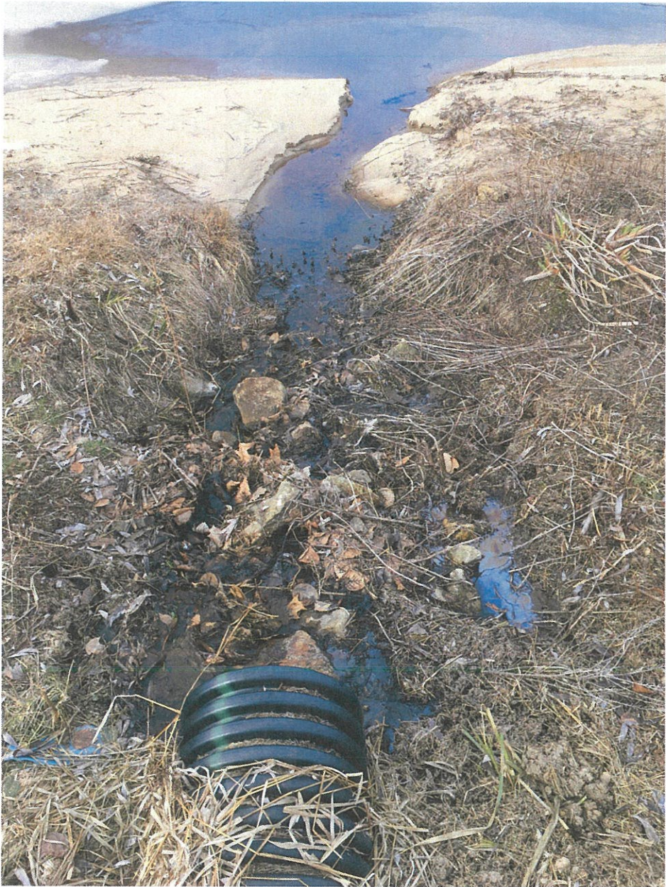
Figure 1 Murry Lake Outfall