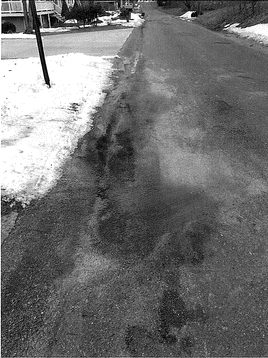
Causeway Dr Spill Location