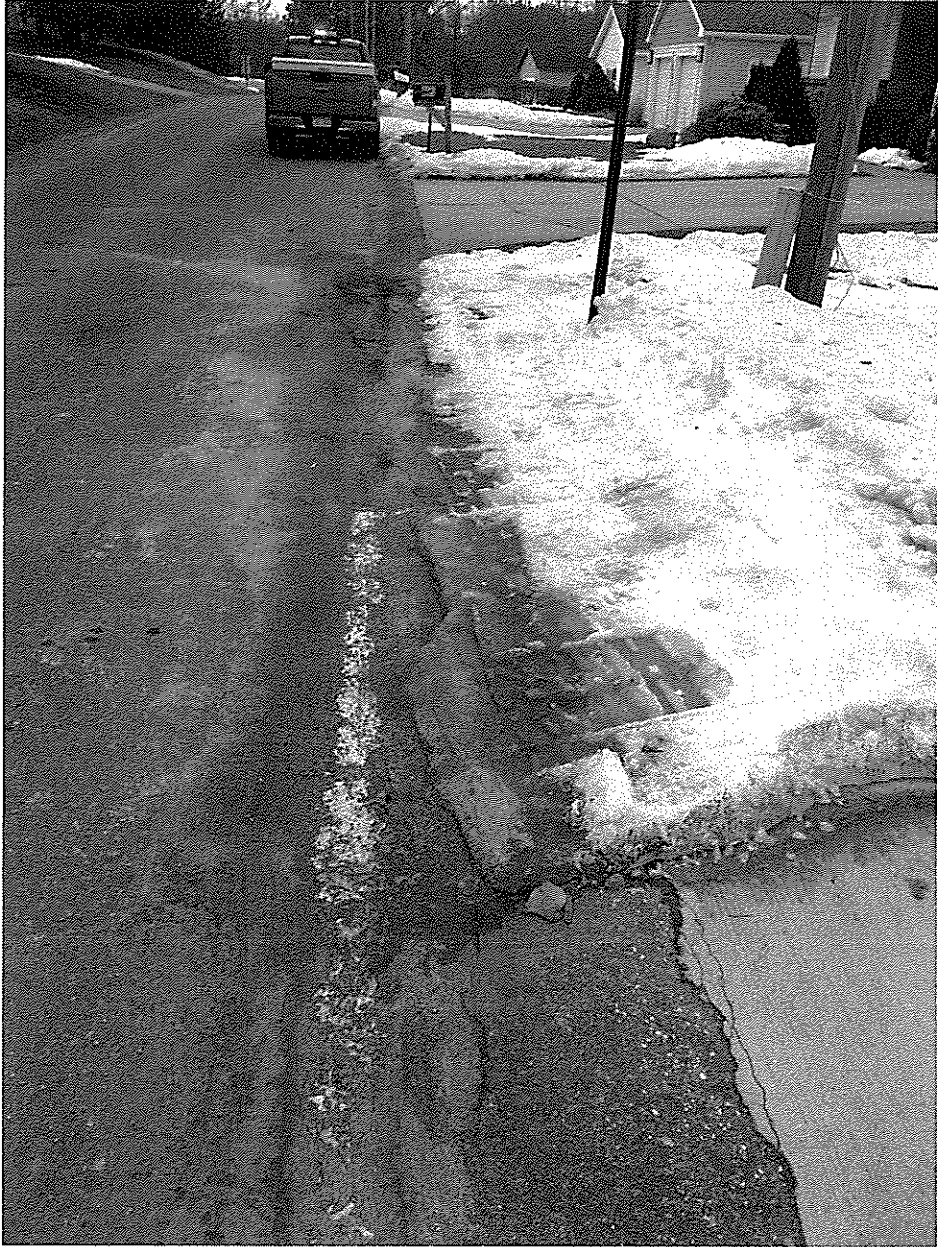
Causeway Dr Spill