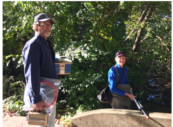
Setting up the stream monitor