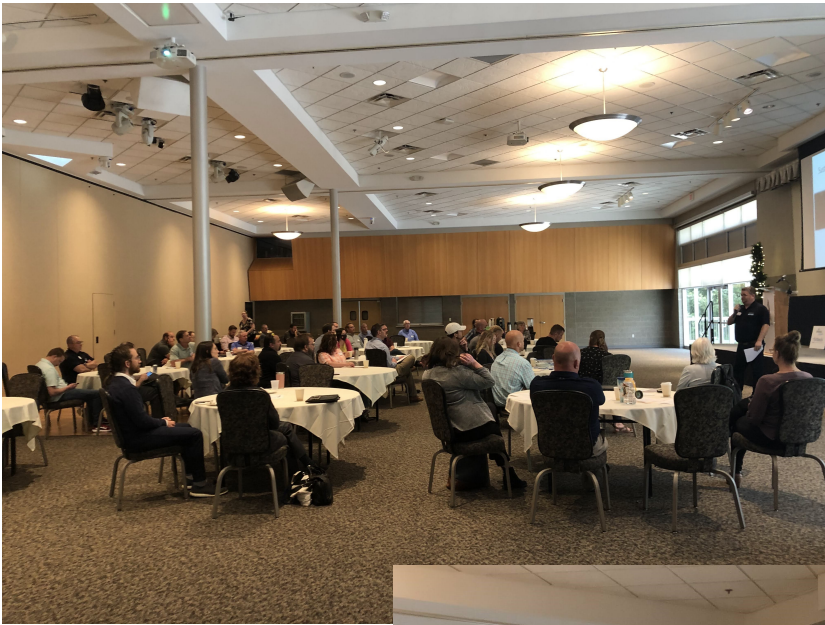
The Friday Forum event served as the annual meeting for MS4 managers in the Lower Grand River Watershed.